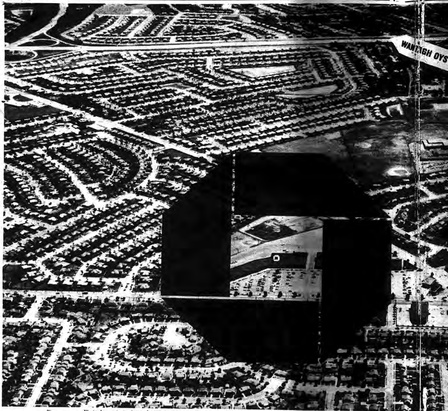
Photo demonstrates how easy it is to reach the Plainview Shopping Center via major arterial highways.