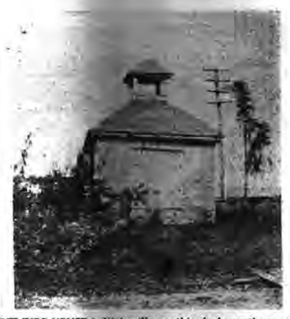
EARLIEST FIRE HOUSE in Hicksville was this shedness the present day main headquarters on East Marie St. How it came into beli the accompanying article.

the scene of destruction was reachd and burning quickly was only keep of kill-a-calf roots and other