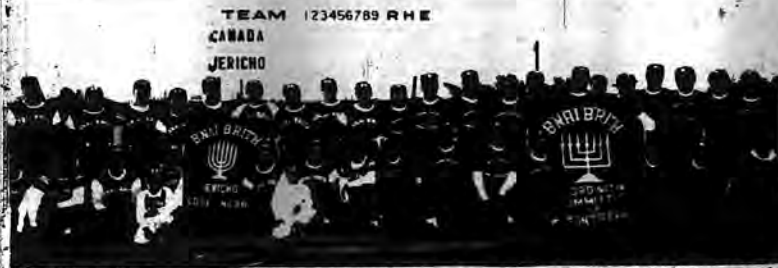
Jericho and Montreal B'nai B'rith Softball Squads at Jones Beach. Jericho won twice, 5 and 8-5.