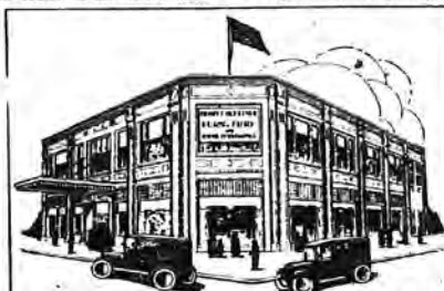
Broadway and Marie St., May, 1923