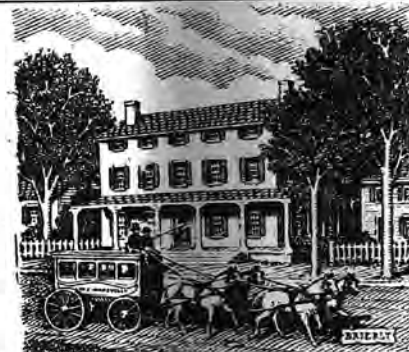
THE GRAND CENTRAL HOTEL.