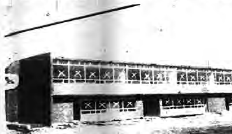
CANTIAGUE SCHOOL as caught by WEST BIRCHWOOD NEWS photographer earlier this week.

Residents of Jericho were today warned by the Fire Dept that on July 16, 17 and 18 the Board of Fire Underwriters experts will be conducting water flow tests in the community. As a result of these tests, which include opening hydrants in certain selected sections and measuring the water pressure, sediment in pipelines is sometimes stirred up. If householders find rust or sediment in their drinking water, they are advised to let the faucet run for a while or not use the water until later in the day.