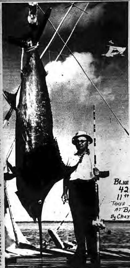
BLUE 42 11 ft TAKEN AT BY By Char.

The battalion spent nine months at the Naval Base, Guantanamo Bay, Cuba.