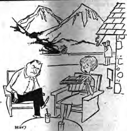
The Christian Science Monitor "They're having unseasonably nice weather back home"

SUBSCRIBE TO THE HERALD by mail. 52 weekly issues $3. Send check, name and address to HERALD, Box 95, Hicksville, N.Y.