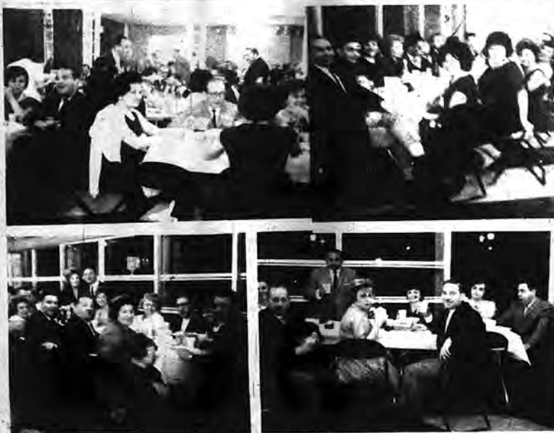
THE VILLAGER photographer gets the story at the Civic Assoc. election affair at Jericho Country Club.