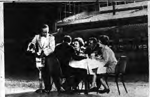
Do you know you can get a superb dinner right at the track?

69 Broadway L 914 Hicksville, N. Y. Opposite L.I. Nat'l Bank WE 1-0414