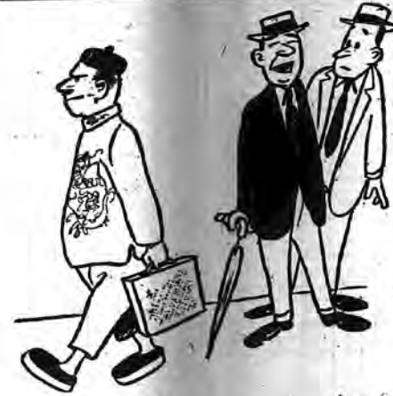
The Christian Science Monitor "He has all his clothes made in Hong Kong!"

NICE, SUNNY ROOM. Quiet location. Near transportation. Gentlemen only. WE 5-2278.