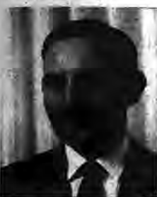
by M.I. LAWRENCE Doctor of Chiropractic

GARDENING is a most rewarding hobby and at the same time can be most dangerous. Considerable bending, twisting, pulling accompanied by strenuous lifting (of earth, peat moss, shrubs, trees, fertilizer, etc.) sometimes from awkward positions and with considerable pull on the lower back can end in a catastrophe.