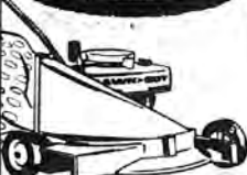
Dual Purpose Grass-Catcher Model 21" cut, $99.95

Why struggle with a balky mower when it's worth big money on a new light weight, easy-handling LAWN-BOY. Trade now and enjoy easier mowing for seasons to come. Models to fit every size lawn - beautiful garden-fashion colors.