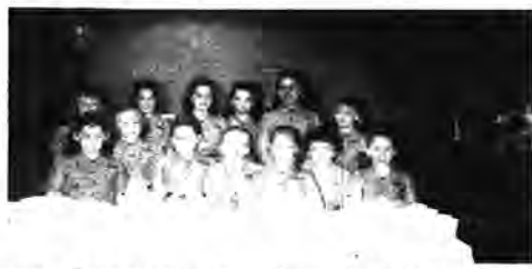
BROWNIE SCOUTS, Troop 556, Hicksville, Burns Ave. Neighborhood Dist. III, celebrate the 50th anniversary of Girl Scouting.

NOTICE TO BIDDERS PLEASE TAKE NOTICE that SEALED PROPOSALS shall be received and must be stamped by the Director of Purchasing of the Town of Oyster Bay, at his office located on the second floor of Town Hall, Audrey Avenue, Oyster Bay, New York, not later than 11:00 A.M. (Prevailing Time) on May 9, 1962 following which time, they will be publicly opened and read in the