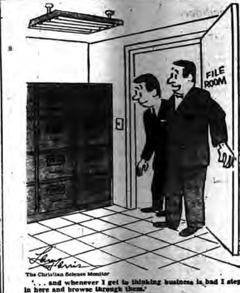
The Christian Science Monitor ... and whenever I get to thinking business is bad I step in here and browse through them.

ROOMS FOR RENT Comfortable nicely furnished room 2 windows, private home. Woman only. WE 8-1812.