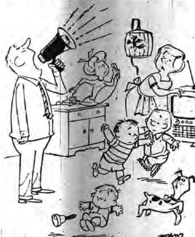
The Christian Science Monitor "Your attention, PLEASE!"

RATES - Word ads - $1.00 for first insertion, 15 words, 10¢ each additional word. Repeat 5¢ word, 75¢ minimum. IMPORTANT: If not accompanied by cash or paid by day of publication, 25¢ billing charge is added.