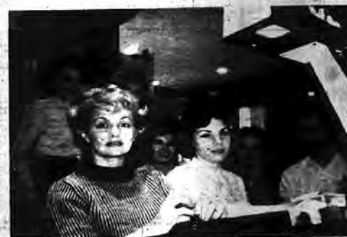
THE LADIES of the bowling league in action.