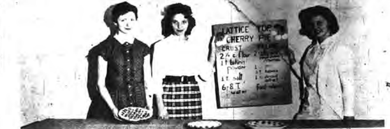
4-H BOYS AND GIRLS learn by doing. Top picture, a group demonstrates electrical wiring. Centre, cooking and homemaking at the Long Island Fair. Bottom, teenagers exhibit pies they make for Achievement Day.