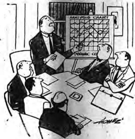
The Christian Science Monitor ... See no end to this boom, gentlemen, people are making payments because they are working! And working because they have payments to make!