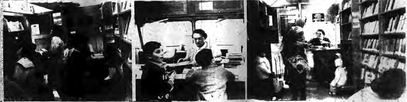
ACTIVITY SCENES Inside the Hicksville Public Library Bookmobile which has now been rolling the streets of the community for a full year.