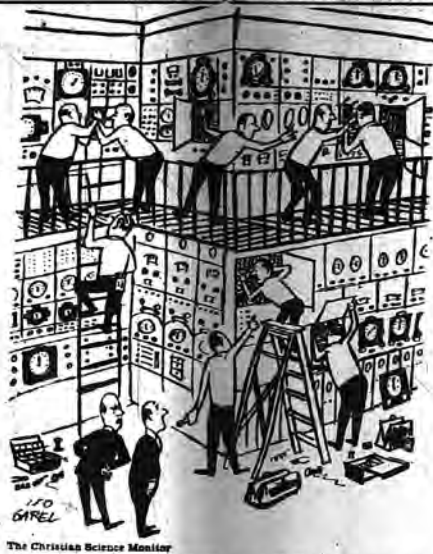
The Christian Science Monitor "It does the work of seven men—if the nine men can get it to work!"

PUPPY FOR ADOPTION female - 7 weeks old, black and white, part collie - wonderful with children. Call MY 4-2992.