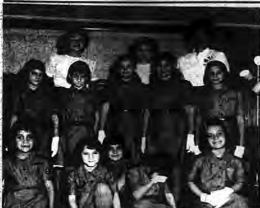
BROWNIE TROOPS 685, 594, and 370 of Robbins Lane, Jericho, neighborhood were invested recently into the Girl Scouts.