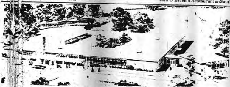
WILLET AVE Elementary School is scheduled for completion by Sept. 1, 1962. Delayed almost two years by a taxpayer's suit, the Board of Education will open bids on the building and other construction projects on Aug 8th. It will be a kindergarten through 3rd grade school, the first of its type for Hicksville.