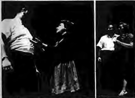
DRAMATIC scenes from "Marty" as staged by West Birchwood residents.