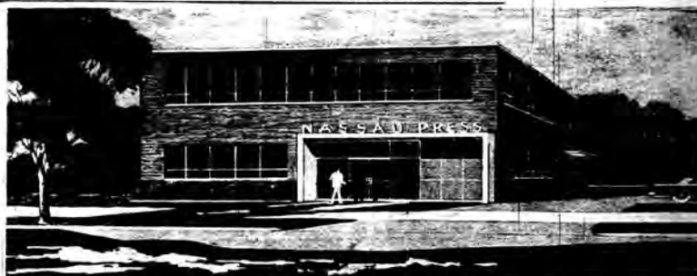
NASSAU PRESS will occupy this new building on West John St., Hicksville.