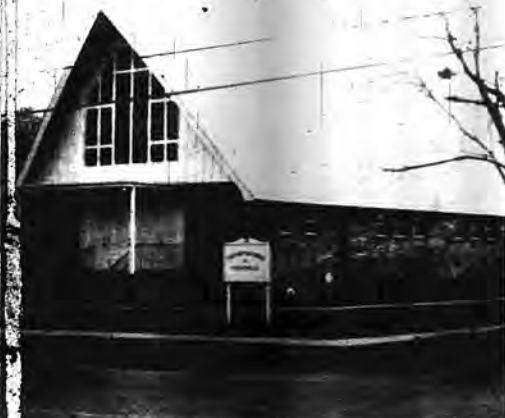
RECENT PHOTO of the new edifice of the First Baptist Church, located at the intersection of Liszt St. and Pollok Pl., Hicksville. The formal dedication will take place this Sunday, April 30 at 3:00 P.M.