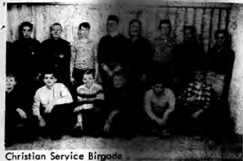
Christian Service Brigade