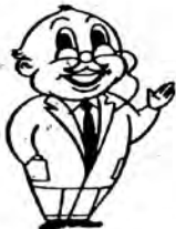
Mr. "Meadow Brook"