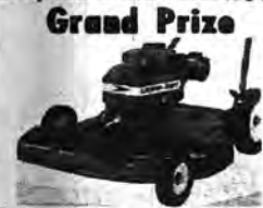
Henry Q. Lown Boy Rotary House

FREE ROSES to first 500 Ladies from our Florist Dept. BALLOONS to all kiddies ENTOMOLOGIST Advice LECTURES & DRAWINGS Every hour on hour - 9 AM to 5 PM