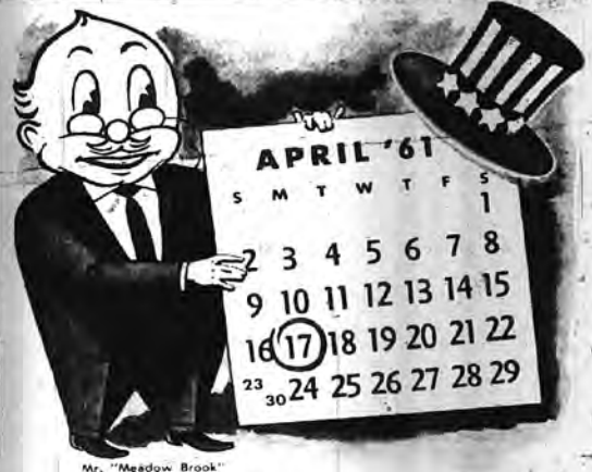
Mr. "Meadow Brook"