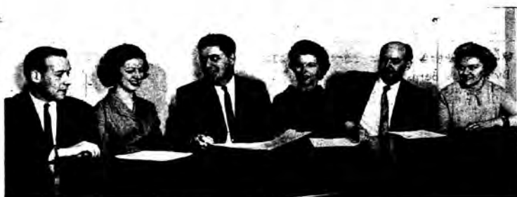
PLAINVIEW OFFICE STAFF

The Meadow Brook trailer bank will provide immediate banking services for the people of Plainview while construction is underway on the permanent building. In addition to regular banking facilities, the trailer is equipped with a night depository for after hours deposits.