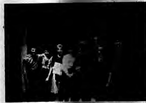
A CANDED SHOT of the Jericho Jewish Center's Youth Group cast during a rehearsal of the musical "FANNY HILL". Dates: April 15 and 16. Place: Jericho High School. For tickets phone: WE, 8-2271 and WE, 8-0946.