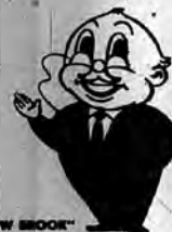
MR. "MEADOW BROOK"

OPEN HOUSE at Meadow Brook's trailer bank in Plainview on April 3, 4, 5, 6 and 7. The new banking facility is located on the east side of South Oyster Bay Road just north of Old Country Road.