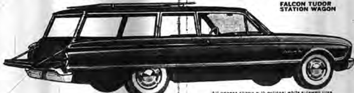
FALCON TUDOR STATION WAGON

More wagon for your money! That's why Ford's been wagon master for 31 years. And now our special Wagon Train Deals can save you even more on the greatest wagon values since Ford invented the first one.