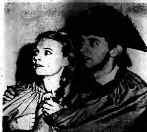
JR. PROGRAMS of Syosset will present its final offering of the current season, at the Syosset High School Auditorium, this Saturday, March 11 at 12:30 and 3 P.M.

Plainview Wine and Liquor Corp. 512-514 Old Country Rd. Plainview, N.Y. DL 246X3/9