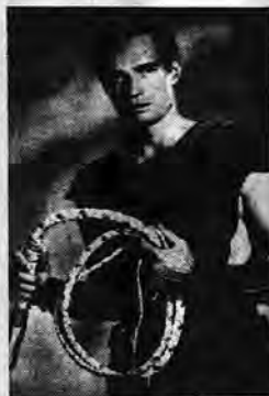
CHARLTON HESTON as he appears in the title role of "Ben Hur" which starts at Century's Shore Theatre in Huntington, Wednesday, Mar. 22. Heston won the "Oscar" for the best actor.

Thurs. March 9-10: Can Can 2:05, 4:25, 6:45, 9:05 Fri. March 11: Cartoon 2:00, Son of Robin Hood 2:40 Sat. March 12-14: same schedule as Thurs.