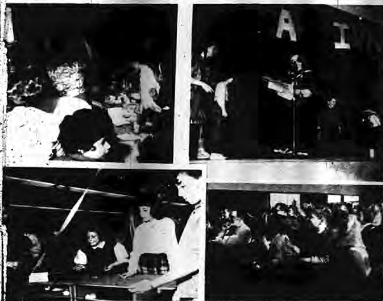
Pictorial report on the Jericho Jewish Centre Purim Carnival.