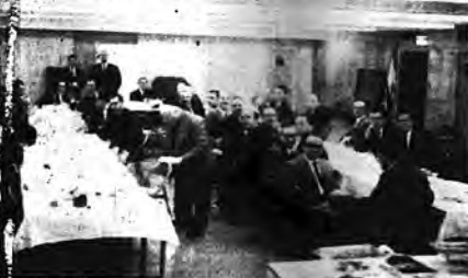
MEMBERS of Jericho Jewish Centre recently held an Adult Education in the center's main student lounge.