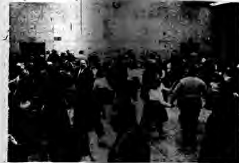
PICTURED ABOVE is the scene in the gymnasium of the Robbins Lane School, Friday night, when the Robbins Lane Girl Scouts hosted their Fathers with a Valentine Day Square Dance. The Girl Scout Troops made all the arrangements, supplied the refreshments, and acted as hostesses throughout the evening. Each troop decorated its own table, and served Hawaiian Punch, doughnuts, potato chips, and pretzels. The fathers enjoyed themselves thoroughly, and everyone hated to go home when the last dance was announced at 9:30 PM.