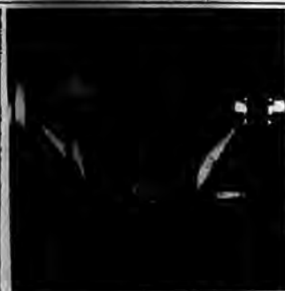
DIAMOND and HECHT