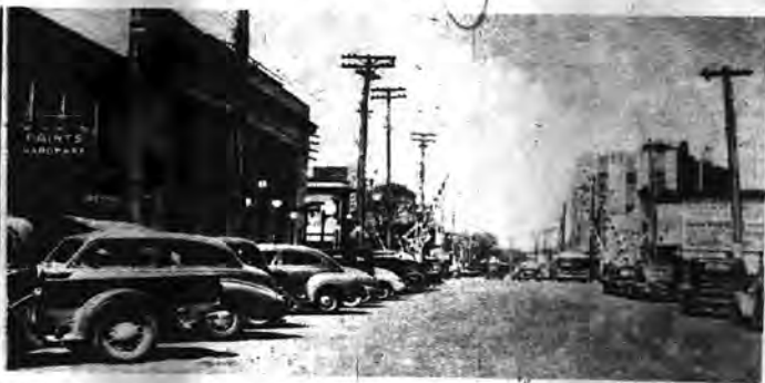
TOP LEFT: Broadway, Hicksville, looking south from the RR crossing at the turn of the century (around 1900). Trees lined the main street. Hahn's Dept. Store was at the left and the Catholic Church steeple is visible in the distance. TOP RIGHT: looking north at the RR crossing about the late 1920s when cars were permitted to park diagonally on the one side. The Professional Bldg. is at the right and the trees are gone. BELOW: More recent view of Broadway, again looking south, from the roof of the Professional Bldg. Parking meters have replaced trees and hitching posts along the curb. The Catholic Church steeple is again visible.