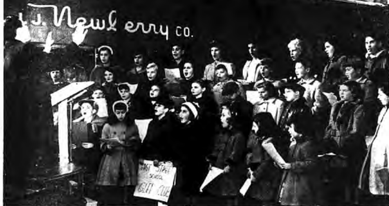
CHRISTMAS MUSIC by youngsters and adults echoed throughout the community during the period before the holiday as these typical pictures indicate. At top, youngsters gather at the Rotary Club's community tree on Broadway to blend their voices. In the centre picture, the