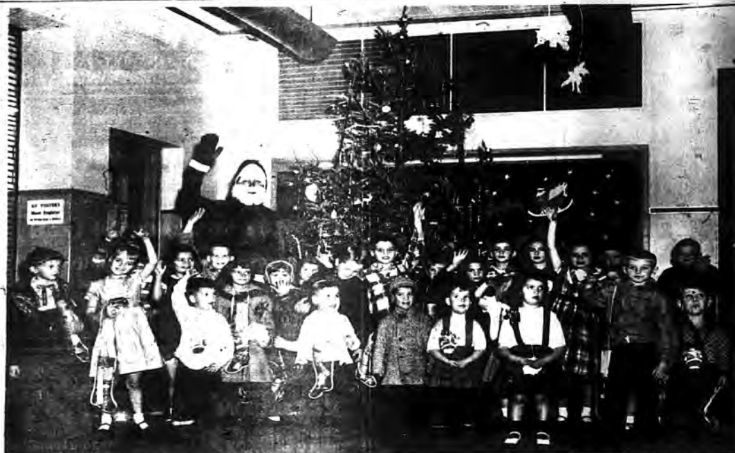
OVER 400 CHILDREN were entertained by Santa Claus at the annual Christmas party of the Northwest Hicksville Junior High School, Saturday. The children and adults' stockings filled with gifts and candy.

tots escorted Santa to the tree and bid him goodbye until next year. After the entertainment, refreshments were served in the school cafeteria. Despite the bad weather, the turnout was excellent and everyone had a good time.