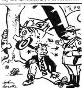
"I REALLY opened her up this time, didn't I?"

However, he has arranged "for a review of the situation on Broadway in your area and as soon as the field reports have been received, will be glad to advise you for the Commission's conclusions."