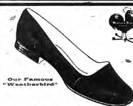
Our Famous "Weatherbird"

regular monthly meeting on Monday, Dec. 3 at 8:30 pm in the Church auditorium. In addition to awarding of a Basket of Cheer, a Grab Bag will be featured.