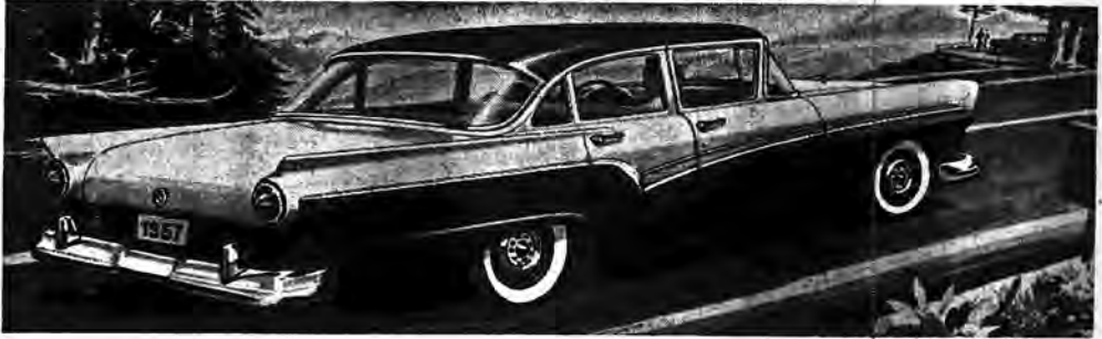
The new Ford Custom 300

From a proved-in-action "Inner Ford" stems a whole car that's built to stay young for years