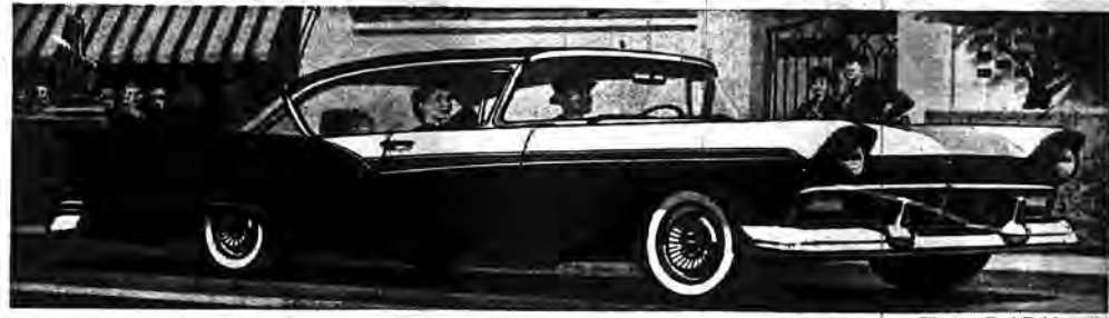
The new Ford Fairlane 500