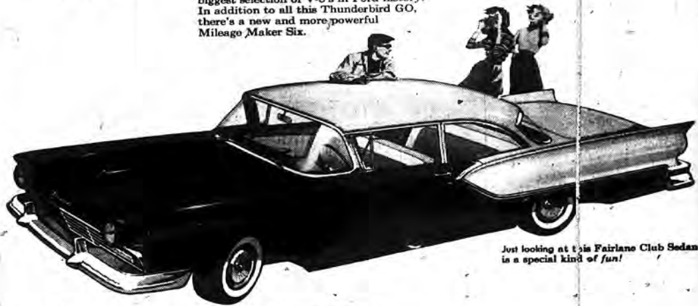
Just looking at this Fairlane Club Sedan is a special kind of fun!

It's the sculptured look. You'll see it the moment you let your eyes wander over this fine car. In a '57 Ford you belong... anywhere. It's the long, lean lines. There's a greyhound grace to the new Ford. No useless "fat," no showy "padding." Ford is as trim as a jet fighter. It's the hardtop styling. Fairlane sedans have the hardtop look of Victorias! Superthin center pillars are smartly concealed to give hardtop beauty when doors are closed. It's the freedom of choice. Colors? Fabrics? Accessories? Far more! Ford gives you a choice of two new, bigger sizes... longer, lower, roomier! It's the ride that stays gentle. With a new frame that rides sweeter and lower, new springs, new suspension all around, even the roughest roads can't ruffle the poise of the new Ford. It's the Thunderbird power. Ford celebrates its Silver Anniversary of V-8 leadership with the biggest selection of V-8's in Ford history. In addition to all this Thunderbird GO, there's a new and more powerful Mileage Maker Six.