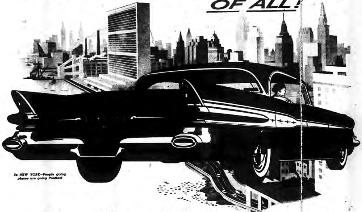
In NEW YORK—People going places are going Pontiac