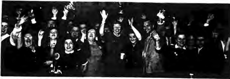
EISENHOWER REPUBLICAN landslide delighted this group at the Hicksville Masonic Temple on Election night where a victory celebration was held.