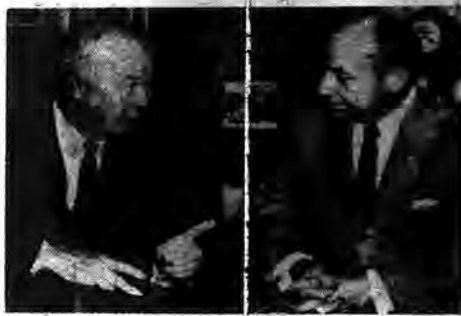
IKE GREETES JAVITS at the White House. Jack Javits, Republican candidate for U. S. Senate from New York, confers at the White House on Oct. 2 with President Eisenhower on the New York campaign.