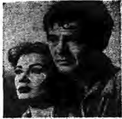
TROUBLE AHEAD in "Back from Eternity" as Anita Ekberg and Robert Ryan face the terrors of the Amazon Jungle. The film is showing at the Cove Theatre, Glen Cove, Sunday and Monday, Nov. 4 and 5.