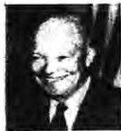
Dwight D. Eisenhower