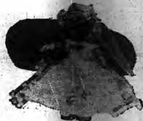
GINNY as a Bride

GINNY dressed as "Queen of All Doll Land"—wearing a beautiful gown of white satin trimmed with gold and lace, and a robe of purple velvet with white fur. She has a gold crown on her head and carries a scepter in her hand.