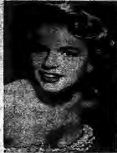
TERRY MOORE shares top billing with Robert Wagner and Broderick Crawford in "Between Heaven and Hell," now playing at Century's Huntington Theatre together with "Rebel in Town".