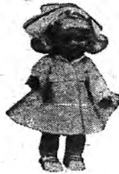
GINNY as a Nurse

The quickest way to a girl's heart is through a doll, and there is no doll so desired by the small set as a GINNY doll. "GINNY", the doll that is almost human, has over 60 outfits for every occasion, and has become a household word with girls of all ages. No gift brings greater pleasure.