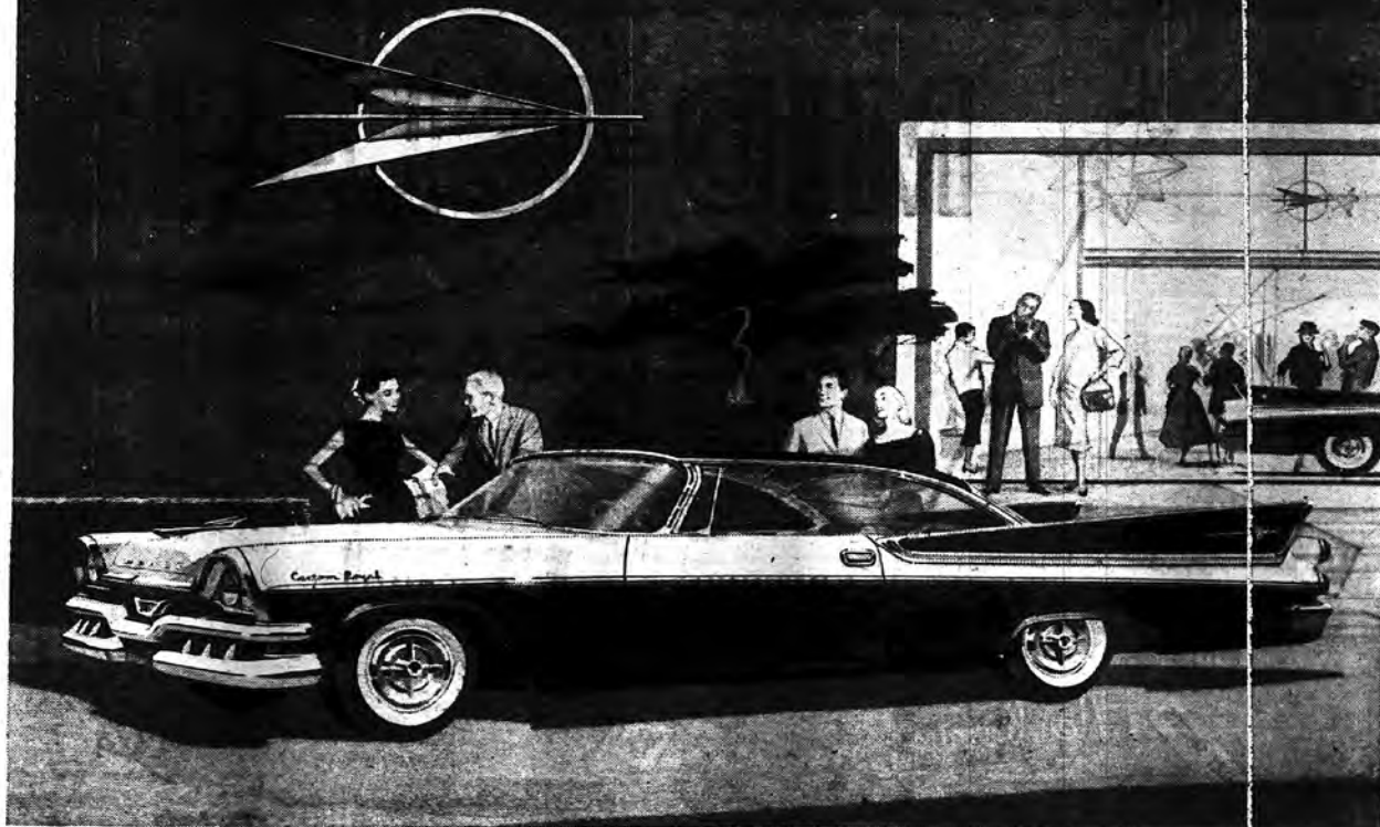
A low-slung beauty with Flight-Sweep style: Swept-Wing '57 Dodge Custom Royal Lancer 2-Door.

Step into the wonderful world of AUTODYNAMICS