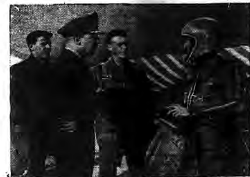
WILLIAM HOLDEN reports his findings to Lloyd Nolan his superior officer during a scene from "Towards the Unknown," the Air Force rocket thriller currently showing at Century's Shore Theatre in Huntington.