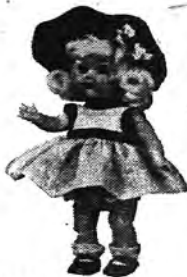
GINNY in her Sunday Clothes

The quickest way to a girl's heart is through a doll, and there is no doll so desired by the small set as a GINNY doll. "GINNY", the doll that is almost human, has over 60 outfits for every occasion, and has become a household word with girls of all ages. No gift brings greater pleasure.