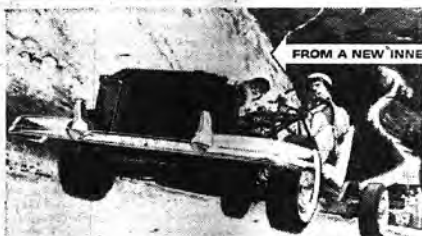
FROM A NEW 'INNER CAR' PROVED IN ACTION

came the magic that made possible so wonderfully different a Ford. In the toughest on-the-road tests ever given to a car, this "Inner Ford" demonstrated that a '57 Ford rides you sweet and low... that it takes the bumps without a bobble, the curves without the pitch... and, that in power, it "takes nothing from nobody!" Nothing on wheels hurries, handles or holds up like a Ford!