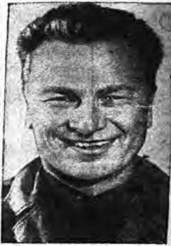
EDDIE ALBERT is starred in "Attack" showing now thru Saturday, Oct. 6, at the Cove Theatre, Glen Cove. Also starred is Jack Palance.