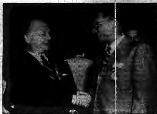
STUYVESANT WAINWRIGHT, Republican congressman from New York's first district which embraces the Mid-Island area together with Suffolk County, shown with Fred Seaton, Secretary of Interior. The two had occasion to greet each other at the Republican national convention held in San Francisco.

MID-ISLAND HERALD, OCTOBER 4, 1956 — PAGE 11