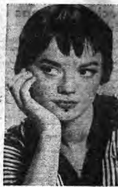
NATALIE WOOD co-stars with Tab Hunter in the outdoor action drama "The Burning Hills" starting Sunday at Century's 110 Drive-In Theatre.

Contribute now to Nassau County POLICE BOYS CLUB, Inc. Police Headquarters, Mineola, N. Y.