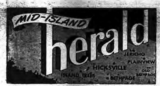
Vol. 9, No. 37-Hicksville, N. Y., Sept. 20, 1956-Copy 5 Entered as Second Class Matter at Hicksville, N. Y., Post Office