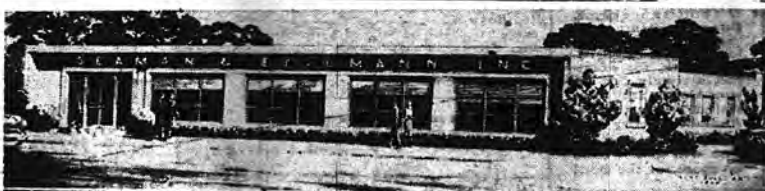
167 Broadway SEAMAN & EISEMANN, INC. Hickville INSURANCE AND REAL ESTATE SINCE 1889 Phone Wells 1-0600