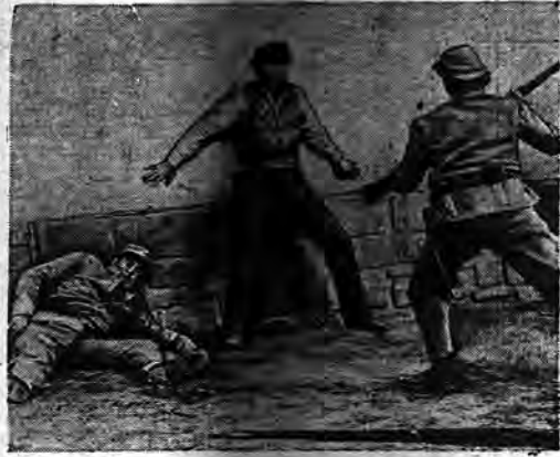
CORNERED after the most daring spy raid of the Civil War fails, Fess Parker as James J. Andrews, leader of the espionage band, that stole the "General" and raced it for 87 miles, expects no quarter in this suspense filled episode in Walt Disney's "The Great Locomotive Chase" currently showing at Century's Huntington Theatre.

Give now to Nassau County POLICE BOYS CLUB, Inc. Mineola, N.Y. Building Better Citizens! Promotes Better Character!