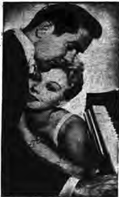
TYRONE POWER , Kim Novak star in "The Eddy Duchin Story" at the Cove Theatre, Glen Cove, now thru Monday, July 16.