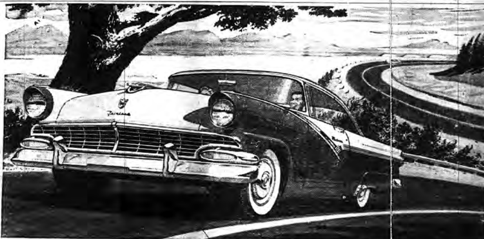
In a Thunderbird Special V-8 engine* 225 eager "horses" await your instructions *Available in Fordomatic Fairlane and Station Wagons