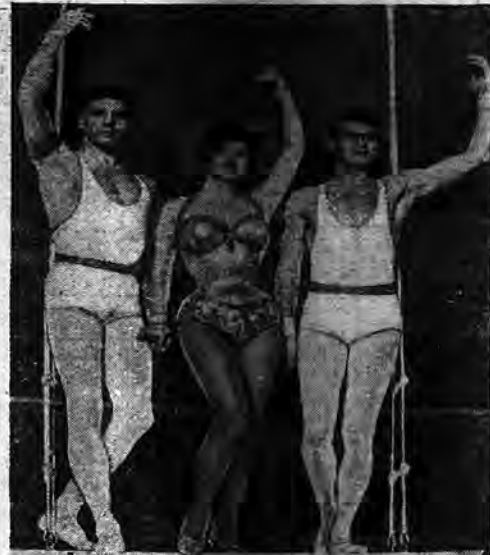
THE THREE STARS of "Trapeze", Burt Lancaster, Gina Lollobrigida and Tony Curtis, prepare to go aloft to perform their startling aerialist act. Filmed in CinemaScope and color, "Trapeze" is showing at the Cove Theatre, Glen Cove, now thru Wednesday, July 4.