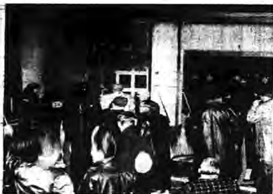
STOCK CAR RACER caught fire in Carl's Service Station at Woodbury Rd. and Park Ave., Hicksville, at 7:30 Friday night, Mar. 30, and caused considerable damage to the building. Flames burned thru the garage doors but were promptly extinguished by members of Hicksville Fire Dept. seen in the foreground as the blaze was quelled.