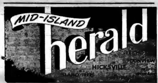
Vol. 6, No. 81-Hicksville, N. Y., Nov. 9, 1954-Copy 5¢