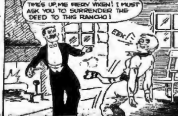
Hair Breadth Harry