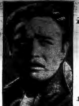
MARLON BRANDO stars in "On the Waterfront" at the Cove Theatre, Glen Cove, now until Sept. 6. The film also stars Karl Malden and Lee J. Cobb and introduces Eva Marie Saint.