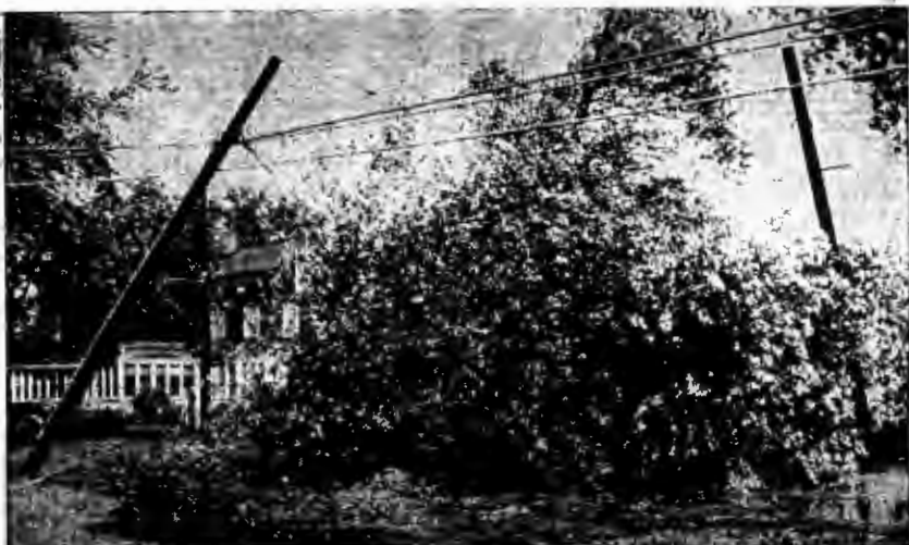
ALL TRAFFIC STOPPED at South Broadway and Lee Ave., Hicksville, where a giant tree fell during the hurricane, Tuesday morning. Wires were snapped, the traffic light fell and a car was buried.

A program for school bus service, being provided this term by Semke instead of Benkert Bus of Bethpage, had been fully developed and then had to be totally revised in the past two weeks to fit the new policy.