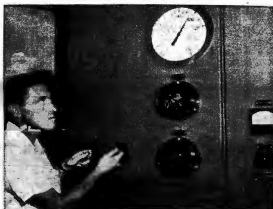
JOHN TRASK, Superintendent of Plainview Water District, keeps a careful eye on the progress of the water supply during the filling of the new million and a quarter gallon storage tank.