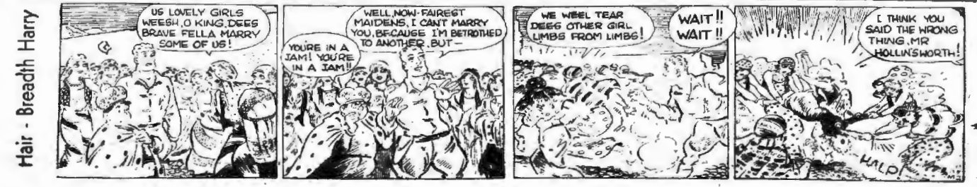
Hair - Breadth Harry

Tax Returns Prepared By Experts 15-17 Herzog Pl. Hicksville next to L. I. National Bank 9:00-6:00 Daily or Call Hicksville 3-6446 for Evening and Saturday Appointment