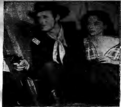
GUY MADISON and Joan Weldon are starring in "The Command" which starts at the Skouras Cove Theatre, Glen Cove, on Mar. 10.

Monday to Thursday March 8 to 11 RITA HAYWORTH - JOSE FERRER ... in ... "MISS SADIE THOMPSON" In Technicolor — also — "THE NEBRASKAN" with PHIL CAREY In Technicolor Late Show Every Saturday Night at Meadowbrook Last Complete Show at 10 P. M.