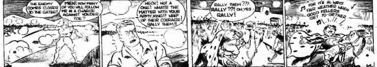
Hair - Breadth Harry

24 HOURS A DAY 7 DAYS A WEEK We Answer Your Phone HICKSVILLE TELEPHONE ANSWERING SERVICE For Business and Professional People Phone: Hicksville 3-5765 120 BROADWAY HICKSVILLE