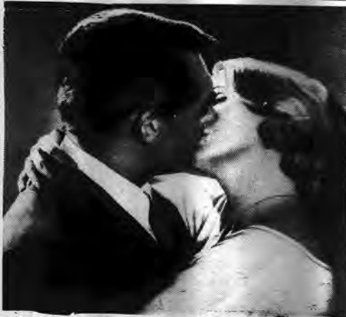
CARY GRANT who co-stars with Eva Marie Saint in a scene from Alfred Hitchcock's thriller "North by Northwest" showing at the Cove Theatre, Glen Cove, now thru Saturday, Sept. 19.

WELLS 1 - 3484 HICKSVILLE HOUSE UPHOLSTERY CO. Custom Built Re-Upholstering Custom Made Slip Covers Draperies and Comices Complete Line of Upholstery Supplies 106 BROADWAY HICKSVILLE, L.I.