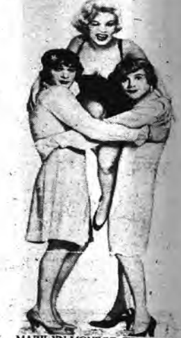
MARILYN MONROE, Tony Curtis, and Jack Lemmon star in Billy Wilder's "Some Like It Hot", a United Artists release now playing at Century's Plainview Theatre.