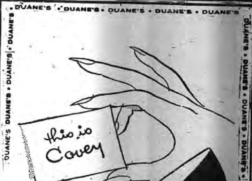
Black - Grey - Beaver or Seaweed - Green - Shag

516 Old Country Road, Just East of South Oyster Bay Road PLAINVIEW, L.I.