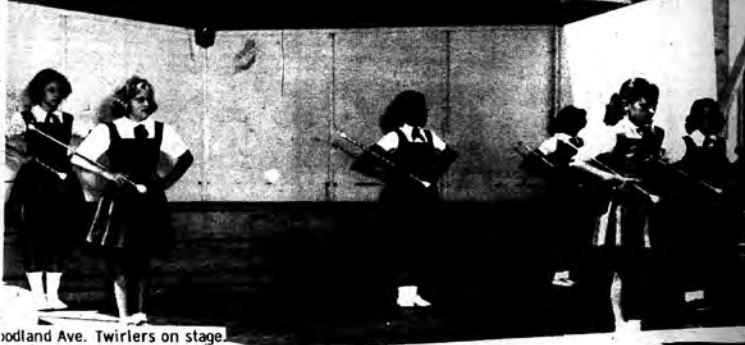
...odland Ave. Twirlers on stage.