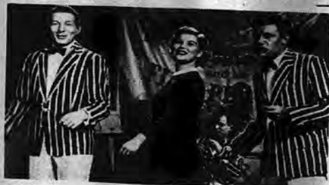
MUSIC MAKERS, Danny Kaye, Barbara Bel Geddes and Harry Guardino belt out one of the 25 songs in "The Five Pennies" showing at the Cove Theatre, Glen Cove, now thru Tuesday, Aug. 18.