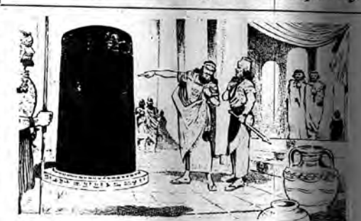
King of Babylon, 539 B.C., observed in black stone (unearthed in 1852)

It is easy enough to pass laws. A good many people today seem to feel that no matter what is wrong, the federal government can fix it by spending more money or passing more laws. But if laws could accomplish economic miracles, the world long ago would have done away with poverty and money worries of any kind, along with any need for hard work and thrift.