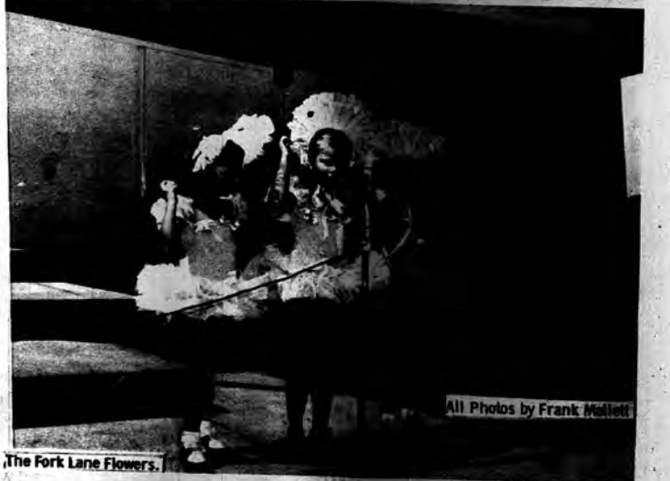
The Fork Lane Flowers.