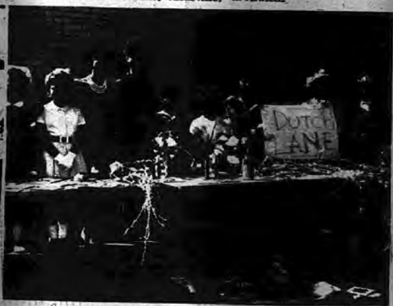
ARTS AND CRAFTS prepared by Hicksville Playground participants during the summer were exhibited by Burns Ave. (at left) and Dutch Lane as well as all other Hicksville schools during the Playground