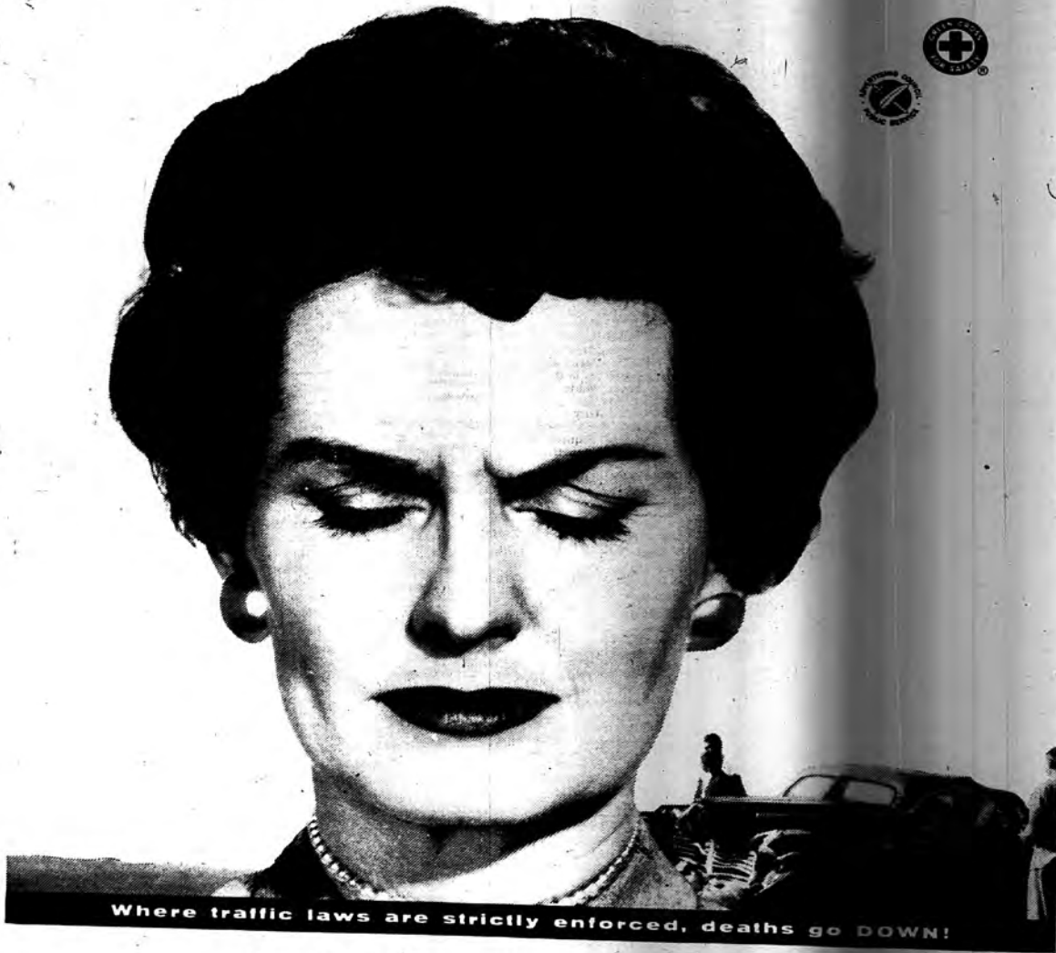
Where traffic laws are strictly enforced, deaths go DOWN!

Remember when horses wore blinders to keep them from being distracted? Maybe drivers ought to wear them—to keep their eyes and minds fixed on the road ahead. Maybe this would keep them from killing themselves or others because of simple inattention! Last year, nearly 37,000 died in traffic accidents. Many just drove off the road or into trees—because they weren't looking! So when you drive, look alive—and stay alive!