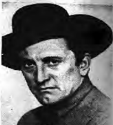
KIRK DOUGLAS and Anthony Quinn star in Hal Wallis' dramatic production, "Last Train From Gun Hill," a Paramount Picture, in Technicolor and Vista Vision now playing at Century's Huntington Theatre.