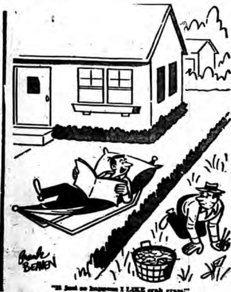
"It just so happens I LIKE crab grass!"