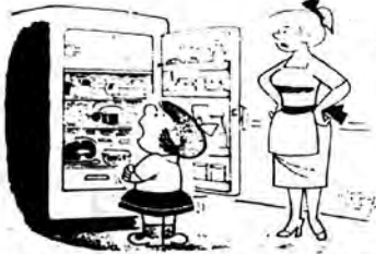
"Bring me a sweater, while I make up my mind!"