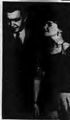
JAMES STEWART and Lee Remick start in "Anatomy of a Murder" now playing at Century's Huntington Theatre.

Savage 12:55, 4:30, 8:30. This Earth Is Mine 2:15, 5:50, 9:35.