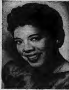
ALTHEA GIBSON, noted athletic star, has an important role in "The Horse Soldiers" now thru Saturday, Aug. 1, at the Cove Theatre, Glen Cove.

Thurs., July 30-The Horse Soldiers 12:35, 2:45, 4:55, 7:25, 9:55. Fri., Sat., July 31, Aug. 1-The Horse Soldiers 12:30, 2:55, 5:25, 7:55, 10:25. Sun. thru Tues., Aug. 2 to 4 The Giant Behemoth 12:30, 4:10, 8:00. John Paul Jones 1:55, 5:35, 9:25. Wed., Thurs., Aug. 5, 6-The Little