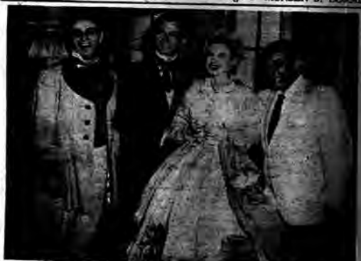
Guy Lombardo, "Song of Norway" Impresario is raptly fascinated by one of the beautiful scenes. Sharing his attention are Helena Scott, who portrays the beautiful Nina, William Olvis as Rikard and J.C. in Resonance as the inspired Norwegian composer, Edvard Grieg.