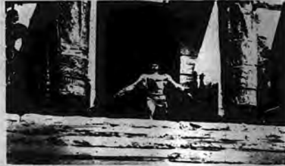
A SCENE from "Hercules" showing at the Cove Theatre, Glen Cove, now thru Saturday, July 25.

Thurs., Fri., July 23, 24. Born Reckless - 2:00, 8:45, Hercules - 3:30, 7:00, 10:00. Sat., July 25. Born Reckless - 2:00, 5:10, 8:25, Hercules - 3:25, 6:35, 9:45. Sun., July 26. Angry Hills - 2:00, 5:20, 8:50, Ask Any Girl - 3:45, 7:05, 10:30. Mon. Tues., July 27, 28. Angry Hills - 2:00, 5:20, 8:45, Ask Any Girl - 3:45, 7:10, 10:30.