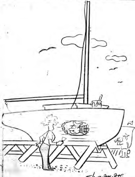
"I got rid of the barnacles."

A. MESCHKOW Licensed and Bonded Plumbing and Heating Contractor Bathrooms installed Repairs "ULCO Reg. Dealer" WElls 5 - 4 6 0 3