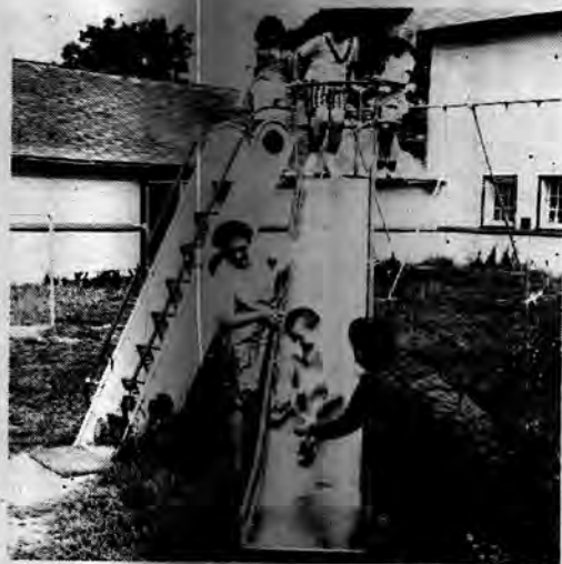
FUN IN THE SUN. Recarded children under special supervision can have a wonderful summer at the special Summer Day Camp, operated in Brookville, by the Nassau Asso. for the Help of Retarded Children. Outdoor games, two pools and an arts and crafts and music program will be provided, all supervised by one counselor to every four children. A total of 220 already are enrolled. More wish to get in but cannot, because of limitation of special instructors and equipment.