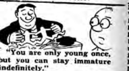
"You are only young once, but you can stay immature indefinitely."