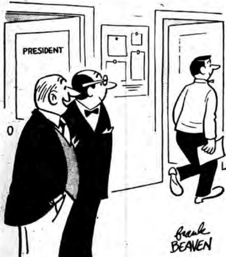
"He's got what it takes...an absolutely undetectable signature!"

We Are As Near As Your Phone WE 5-1122 HICKSVILLE CESSPOOL SERVICE