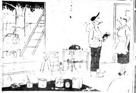
"The fellows are going on a fishing trip, dear... is it all right with you if I take a little vacation during my vacation?"

GIRLS-WOMEN. FULL-PART TIME. The Donut Man, 400 So. Cyster Bay Rd., Hicksville, next to Plainview Theatre.