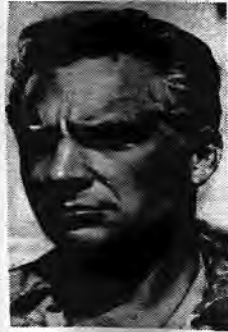
HANDSOME Rossano Brazzi is starring in "South Pacific" now in its second big week at the Cove Theatre, Glen Cove, thru June 23.

110 DRIVE-IN, Huntington Thurs. thru Sat., 6/18-20: The Young Philadelphians, 8:55, 12:55; Born Reckless 11:40. Sun. thru Tues., 6/21-23: The World, the Flesh, and the Devil