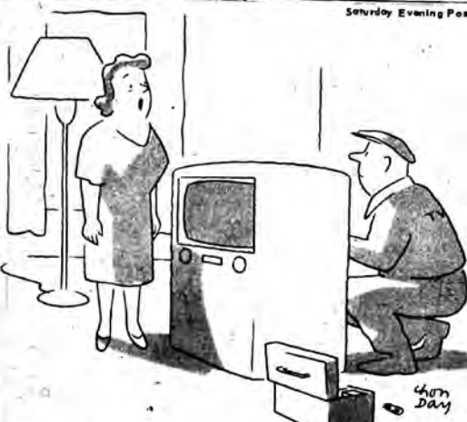
"Is there anything you can do to improve the quality of the programs?"