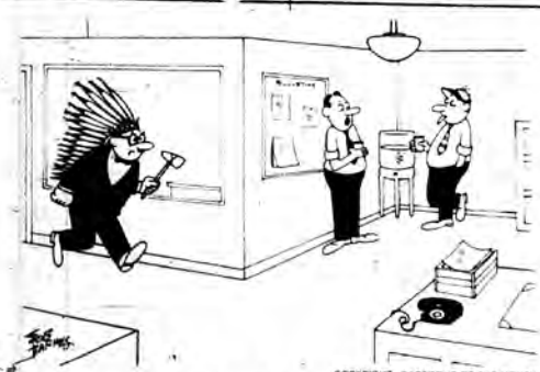
"Watch out for the old man - he's on the warpath today!"