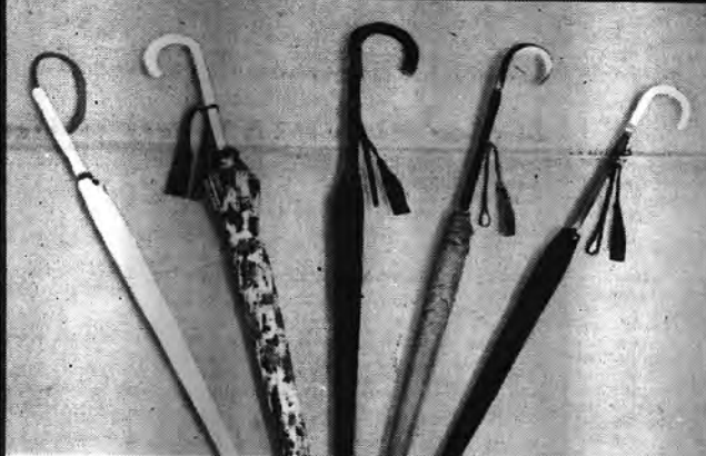
High Fashion Umbrella — Your choice of a ladies' fine quality slim-jim umbrella, quick-drying acetate; imported handles.

if you open an account of $20 or more (only one gift to a person)