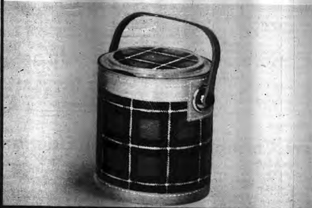
Sketch: Kooler — 1 gallon insulated vacuum jug keeps contents hot or cold for hours.