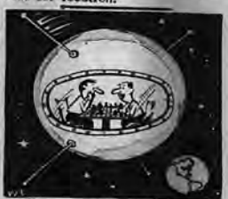
"I can see the old gal now -- stomping around in her flat heeled shoes, kicking at the dog, snarling at the cat..."

Inasmuch as THE VILLAGER is a committee of the Civic Assoc., we welcome all members to join the staff. We meet every Monday evening -- call the Editor at WE 8-8655 for location.