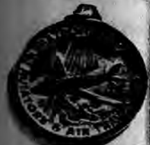
One face of Our Lady of Loretto Medal.