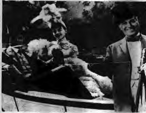
LESLIE CARON, Maurice Chevalier and Louis Jourdan head the cast of "Gigi" returned by special request and showing now thru Tuesday matinee, April 14, at the Cove Theatre, Glen Cove.