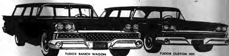
TUDOR RANCH WAGON

The 1959 Fords are beautifully proportioned for people-built for comfort. Wider door openings make it easier to get into and out of a Ford. There's more stretch-out room for six big people . . . more room for elbows, legs, hips, hats. And everybody, even the middle man, rides on a deeply padded seat.