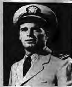
JAMES 'MAVERICK' GARNER who co-stars with Edmond O'Brien in "Up Periscope" showing at the Skouras Cove Theatre, Glen Cove, Sunday thru Tuesday, Mar. 29 to 31.

PLAINVIEW THEATRE Thurs.-Fri. Mar. 26-27 - Some Came Running 2:00, 5:15, 8:40. Wild Heritage 1:05, 4:20, 7:35, 11:00. Sat. 3/28 - Animal World 12:05, 2:45. Tarzans Fight for Life 2:00, 4:10. Some Came Running 5:40, 8:15, 10:50. Sun. 3/29 - Some Came Running 1:20, 5:00, 8:40. Wild Heritage 12:20, 3:50, 7:25, 11:00. Mon.-Tues. 3/31-4/1 - Tonka 10:45, 1:55, 5:15, 8:40. At War With the Army 12:20, 3:40, 6:55, 10:15.